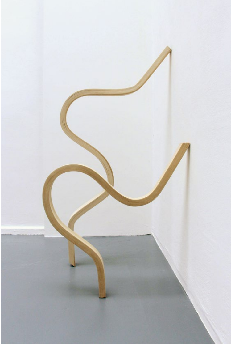
Emily Stollery Stand, Lean – Others Don't (They Don't Do That) , 2018 Tulip wood, adhesive, oil 63 × 40 × 4 cm and 102 × 30 × 4 cm approx. £3,250 (sold as a pair)