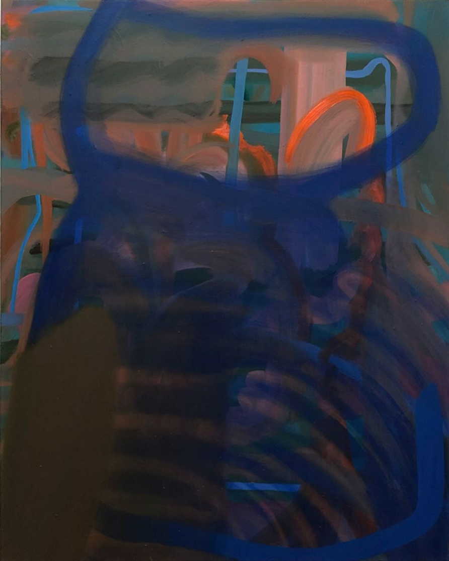
Sunyoung Hwang Well Deserved , 2021 Acrylic and oil on canvas 105 × 85 cm £3,500