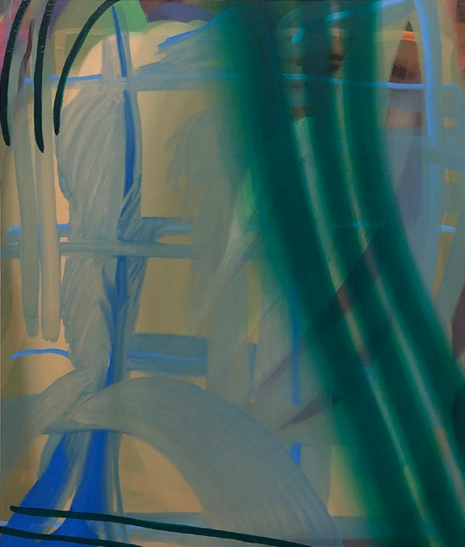
Sunyoung Hwang Her Window , 2020 Acrylic and oil on canvas 132.5 × 112 cm £4,000