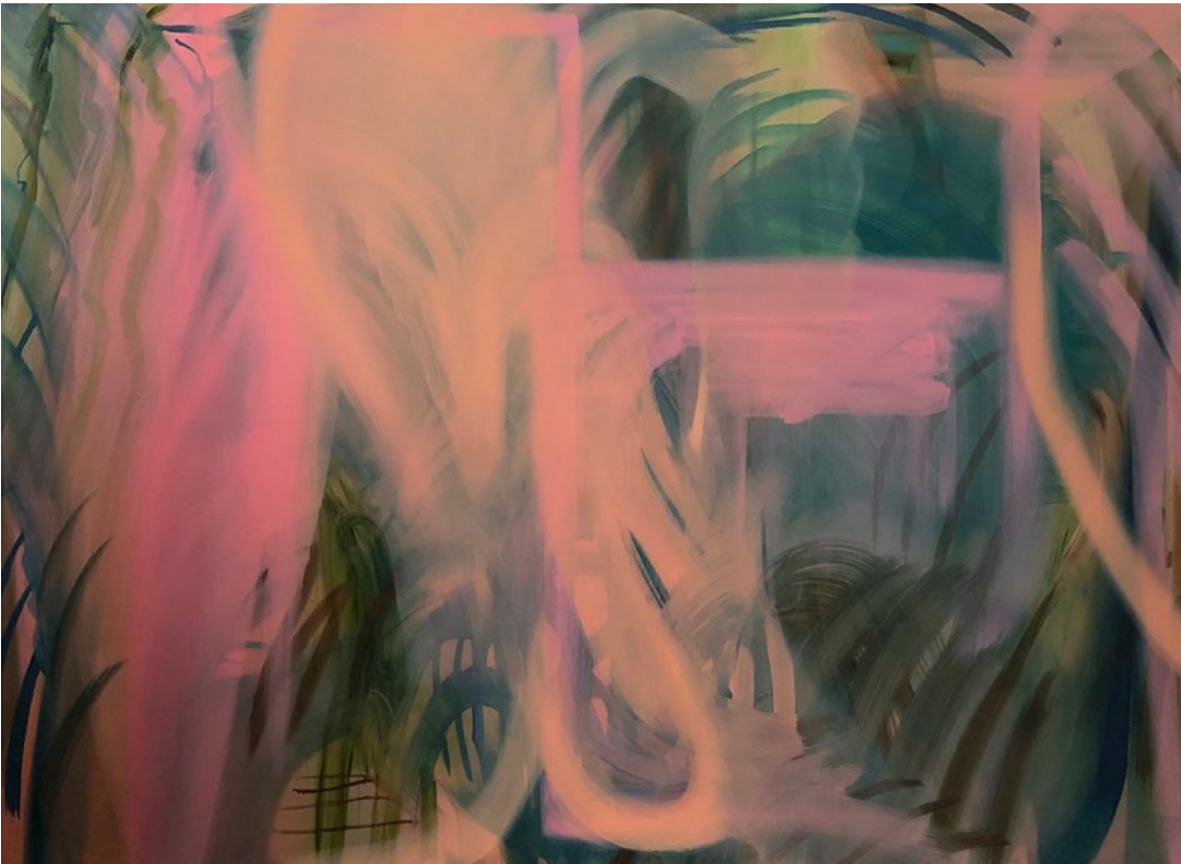
Sunyoung Hwang Swimming Backwards , 2021 Acrylic and oil on canvas 150 × 205 cm £6,000