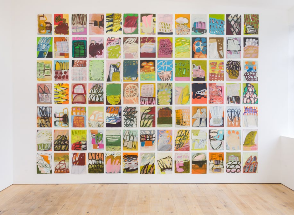
Henry Ward 91 works on paper installed as a grid, 2018–2021 Acrylic on 300gsm paper 42 × 30 cm each approx. £500 each (unframed)