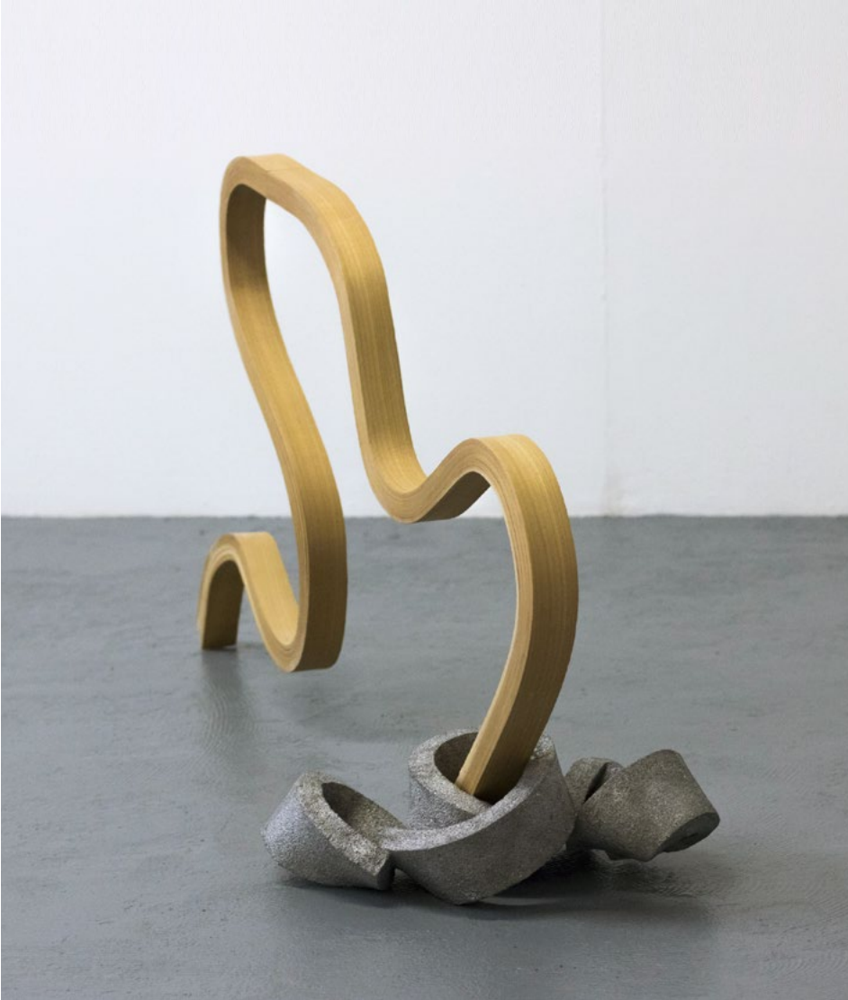
Emily Stollery Don't Be Hesitant , 2020 Tulip wood, adhesive, oil, aluminium 110 × 55 × 37 cm approx. £8,450