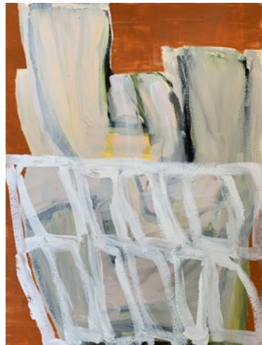
Henry Ward Three works on paper exhibited framed, 2018–2021 Acrylic on 300gsm paper 42 × 30 cm each approx. £500 each (unframed)