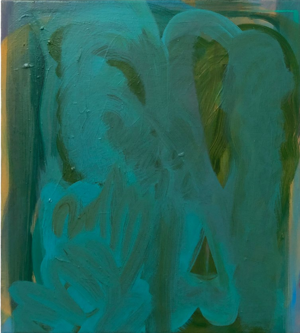
Sunyoung Hwang Seaweed, 2021 Acrylic and oil on canvas 61.5 × 56 cm £2,000