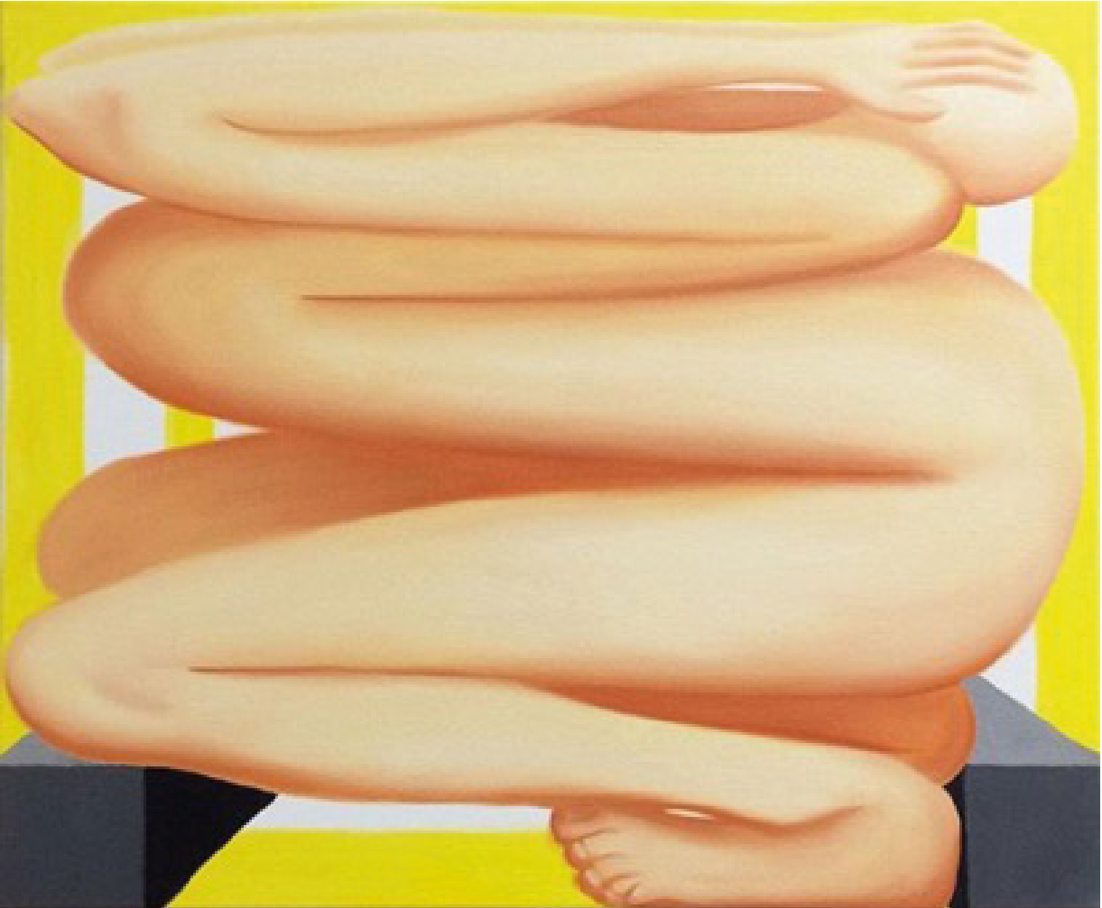
Untitled, 2018 Acrylic and oil on canvas 51 x 61 cm £1,200