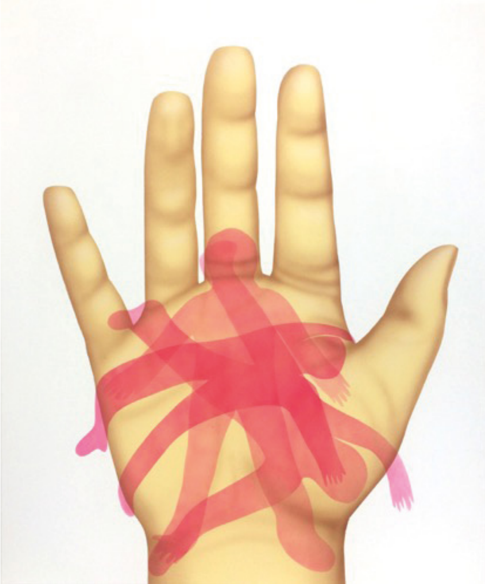
Handful , 2019 Acrylic on canvas 100 × 120 cm £2,400