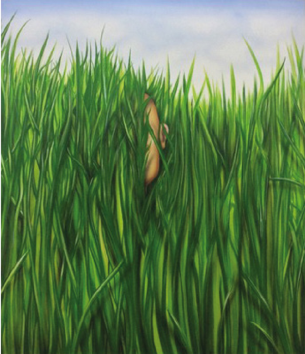
In Grass , 2019 Acrylic on canvas 107 × 92 cm £2,200