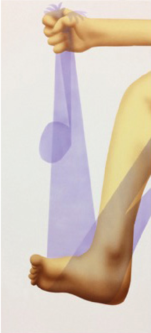
Stretch, 2019 Acrylic on canvas 35 x 75 cm £1,200