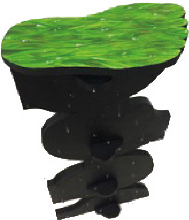
Damp Grass, 2019 Acrylic on wood 74 x 31 x 15 cm £900