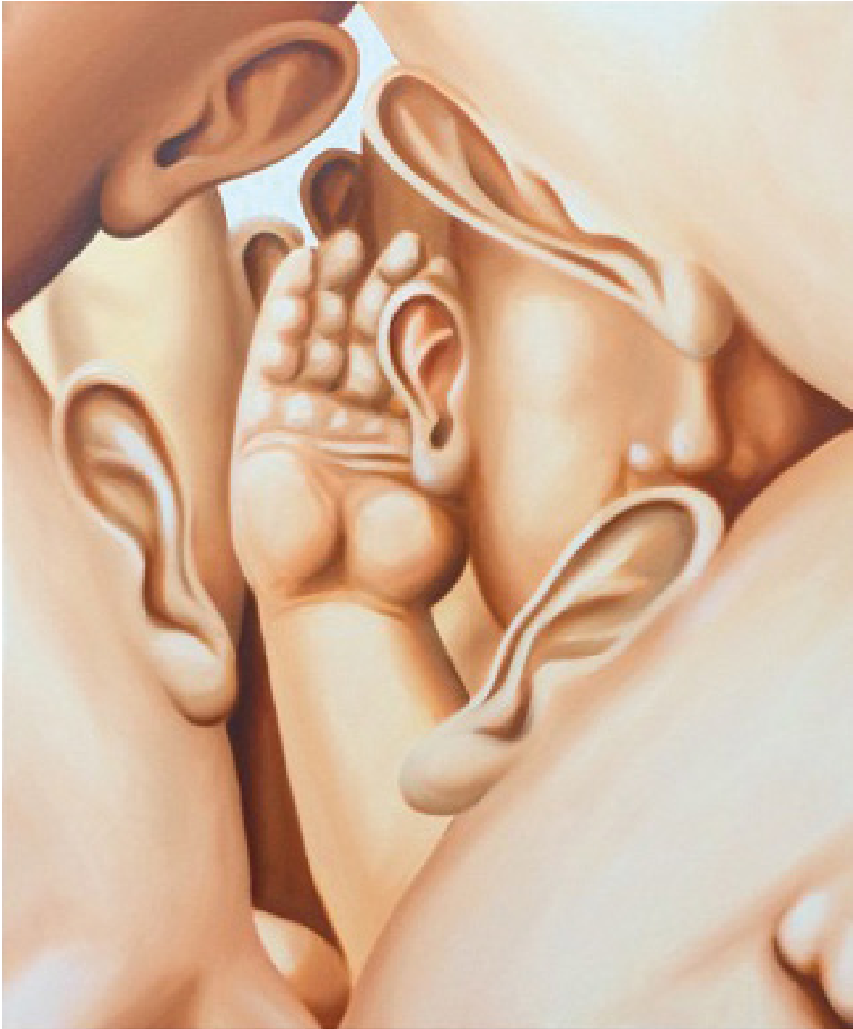
Listeners , 2019 Oil on canvas 51 × 61 cm £1,200