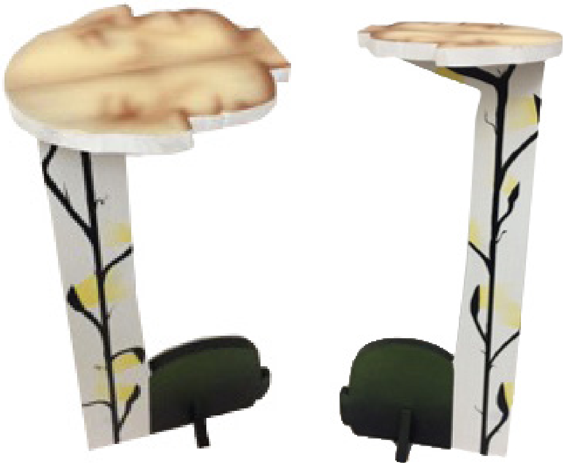
Light plant / Janiform, 2019 Acrylic on wood 69.5 × 24.5 × 22 cm £900