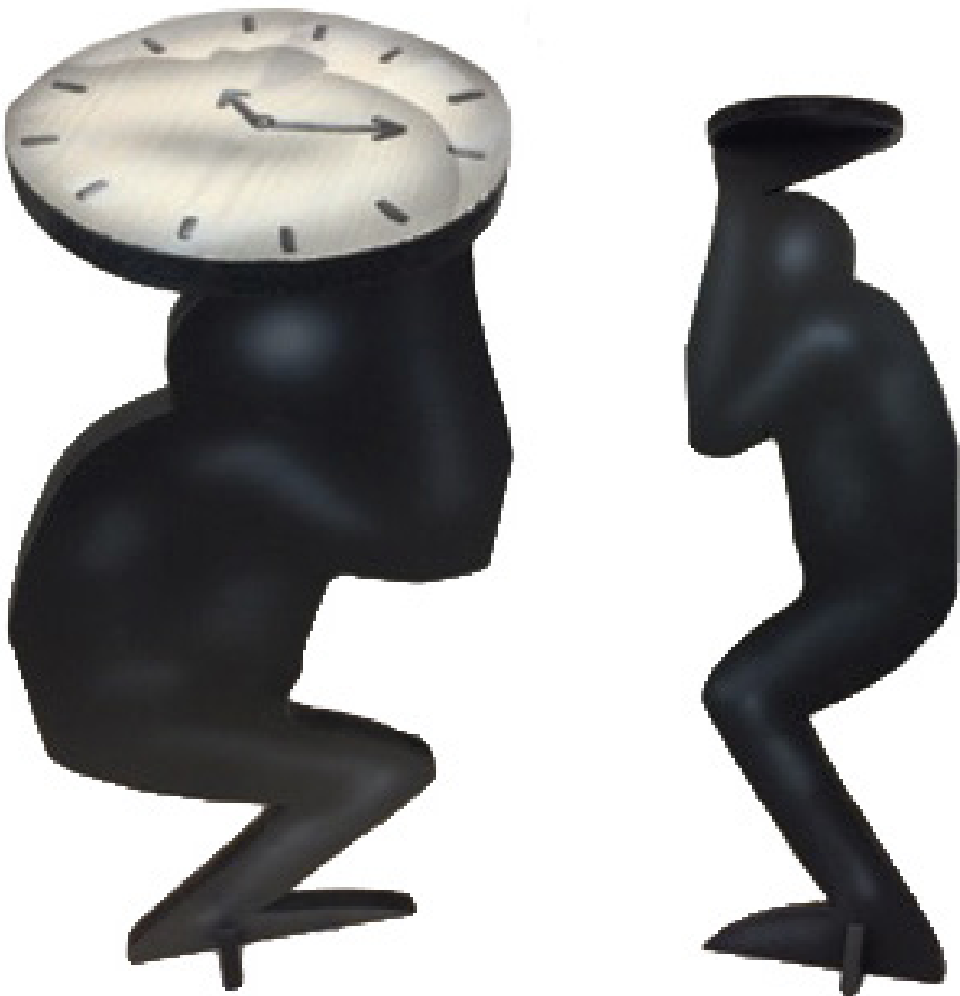
Time , 2019 Acrylic on wood 92 × 21 × 19 cm £900