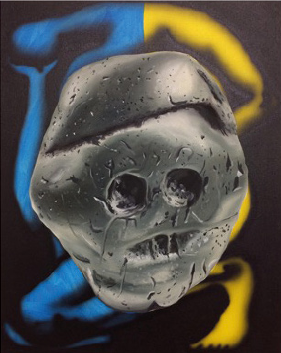
Pebblehead , 2018 Acrylic and oil on canvas 62 × 77 cm £1,500