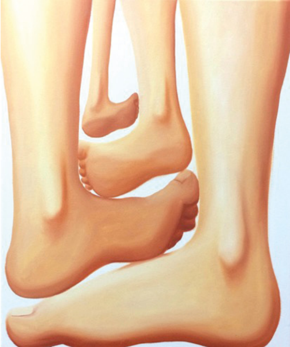
Feet , 2018 Oil on canvas 51 × 61 cm £1,200