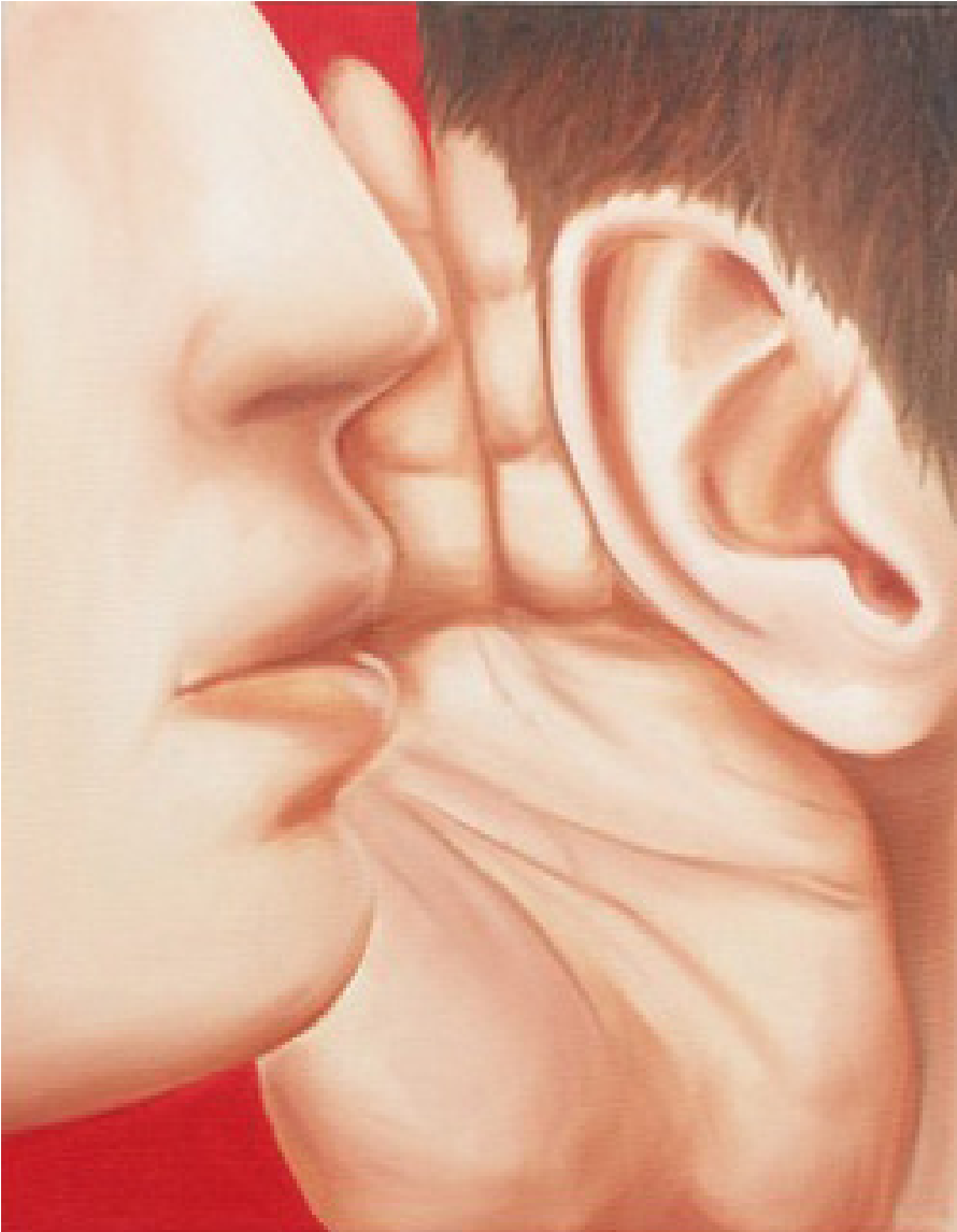
Whisper , 2019 Oil on canvas 28 × 36 cm £700