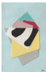
Confection , 2017 Indian ink and waterbased on St Cuthbert's Mill Waterford Saunders watercolour paper 37 × 47 cm £345