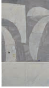
Bleached out, 2017 Mixed media on canvas 35 x 61 cm £900