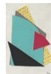
Movie Love , 2017 Indian ink and waterbased on St Cuthbert's Mill Waterford Saunders watercolour paper 37 × 47 cm £345