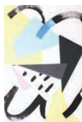
Natural Disorder , 2017 Indian ink and waterbased on St Cuthbert's Mill Waterford Saunders watercolour paper 130 × 89.9 × 3 cm £2,395