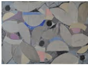
Mirror Image, 2016 Mixed media on canvas 205 x 150 cm £2,500