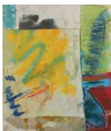
Endless things Growing , 2017 Oil, spray paint and collaged calico on board 38 × 31.5 cm £1,200