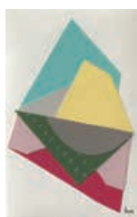
Will We Ever Leave? , 2017 Indian ink and waterbased on St Cuthbert's Mill Waterford Saunders watercolour paper 37 × 47 cm £345