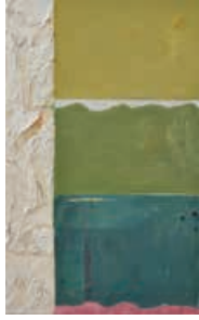
Riser, 2017 Mixed media on canvas 74 x 46 cm £1000