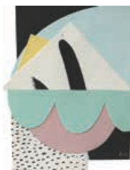
Moon Speak , 2017 Indian ink and waterbased on St Cuthbert's Mill Waterford Saunders watercolour paper 37 × 47 cm £345