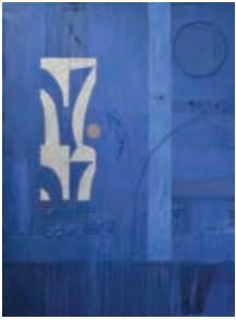
Tranquillize, 2017 Mixed media on canvas 140 x 190 cm £2,500