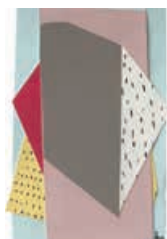
I Know How You Loved , 2017 Indian ink and waterbased on St Cuthbert's Mill Waterford Saunders watercolour paper 37 × 47 cm £345