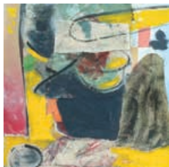
Druids Rock , 2017 Oil and collaged calico on board 30 × 30 cm £900