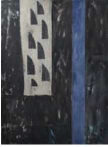
Turns on the Tarmac, 2017 Mixed media on canvas 140 x 190 cm £2,500